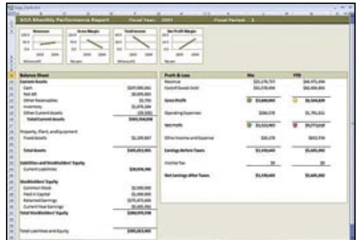
Powerful dashboards can be created directly in Excel, and refreshed with a click of the mouse.

With the BizExcelerator™, you have complete access to your General Ledger data. End users simply enter a BizExcelerator™ function (such as month-to-date net, or year-to-date beginning balance, etc.) and the latest data from your G/L will automatically populate within Excel.